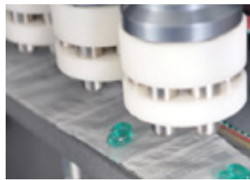
Patented pouch agitation and pill separation