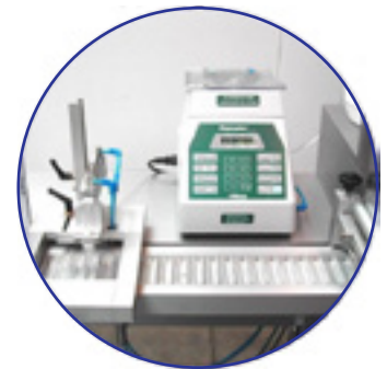
Liquid Dosing System