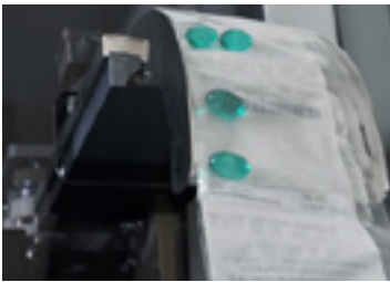
Unlimited pouch entry